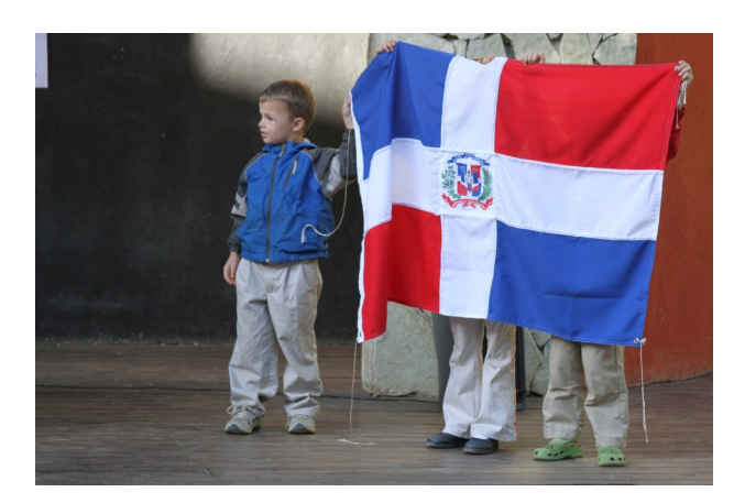
A young student holding the Dominican Republic Flag

My extended time in the Dominican allowed me to not only to observe and learn about the culture but, to literally be absorbed into the community. I lived in a homestay, with a grandmother and her granddaughter, and was welcomed into their family with open arms. The teachers and staff at Doulos, many of whom are Americans, helped me adjust to cultural differences. For me, the greatest challenge was the language barrier. With only one Spanish class under my belt from several years ago, I was forced to learn quickly how to communicate. The community of Jarabacoa, everyone from the motorcycle taxi drivers to the farmers at the vegetable market, showed incredible patience with this "gringa." My internship at Doulos and the experience of living abroad in the Dominican were life changing because I was immersed in Dominican culture and gained perspective and independence.