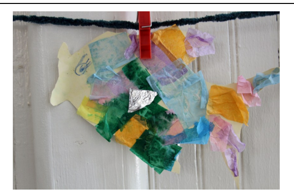
A child's artwork at Doulos Discovery School.

Doulos Discovery School is a private Christian school in the mountain town of Jarabacoa, right in the middle of the country. Private schools are abundant in the Dominican Republic but are costly and therefore only largely available to the wealthy. The public education system is lacking nationwide, which keeps the country's poor trapped in cycle of poverty. Doulos maintains that leaders come from all economic backgrounds. To help bridge the economic gap Doulos provides need-based scholarships to half its students. This creates a unique learning environment where students from varying economic backgrounds work together and gain new perspectives. Dolous' mission statement is to "equip and educate servant leaders through Christian discipleship and expeditionary learning to impact the Dominican Republic."