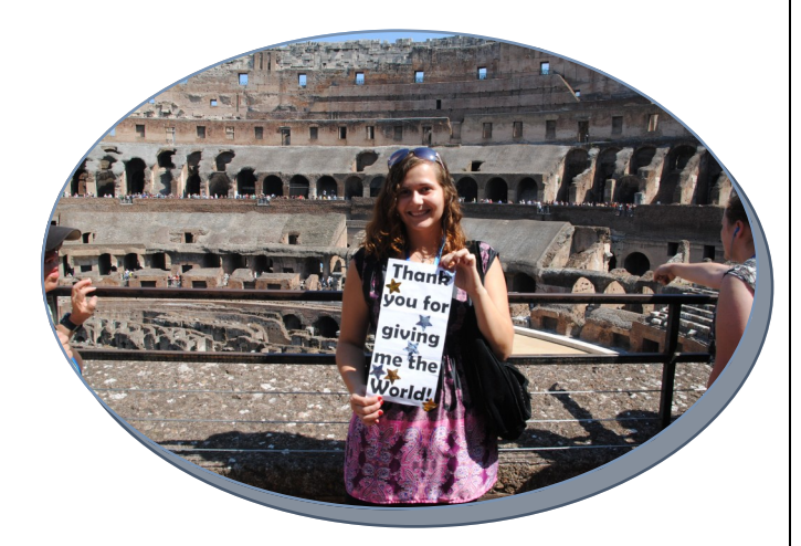
When in Rome...Thank the people who helped you get there.