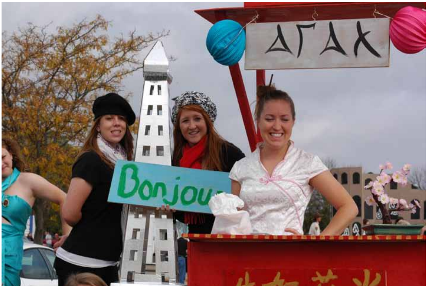
A rendition of the Eiffel Tower on a parade float complements the 2010 Homecoming theme, "The Wonderful World of Washburn."