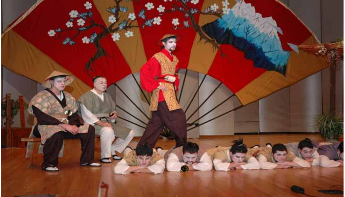
The comic opera, "The Mikado," was presented by the Washburn Opera Theatre during the spring semester 2010.