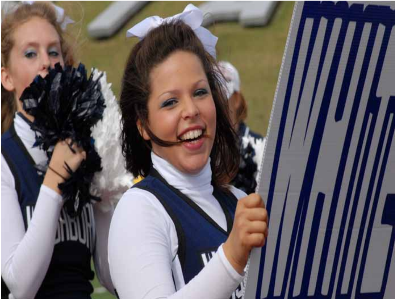
Cheerleaders enjoy motivating the spectators at Washburn athletic events.