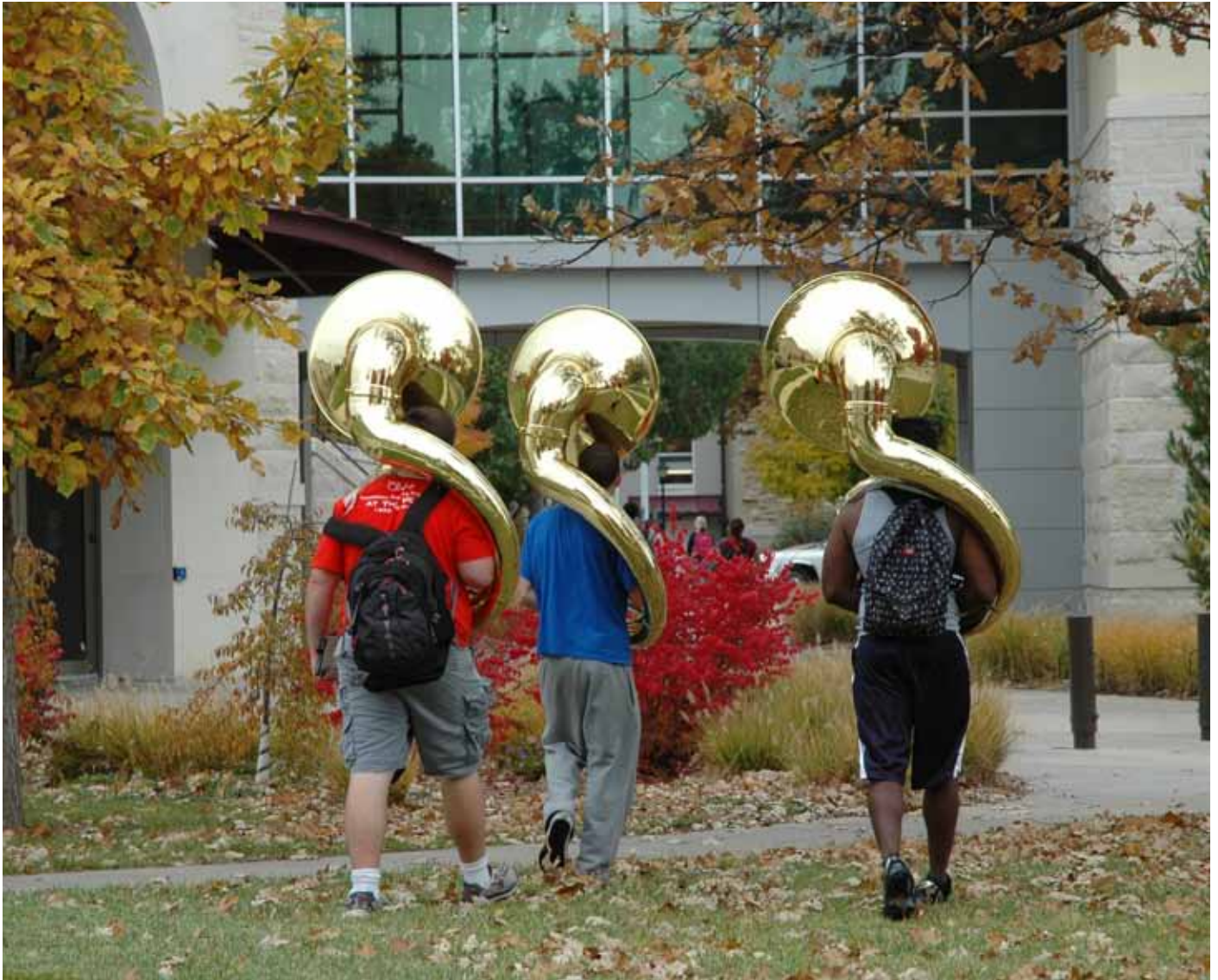
Sousaphone players enjoy the autumn weather as they walk to marching band practice.

Information is available by contacting the Financial Aid Office in Morgan Hall 267 or by calling 785-670-1151 or (800) 524-8447. Admission to Washburn University is a prerequisite for consideration of financial assistance.