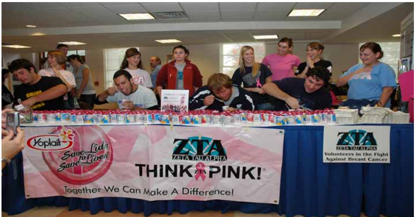
Contestants chow down during a yogurt eating contest fundraiser sponsored by Zeta Tau Alpha sorority.