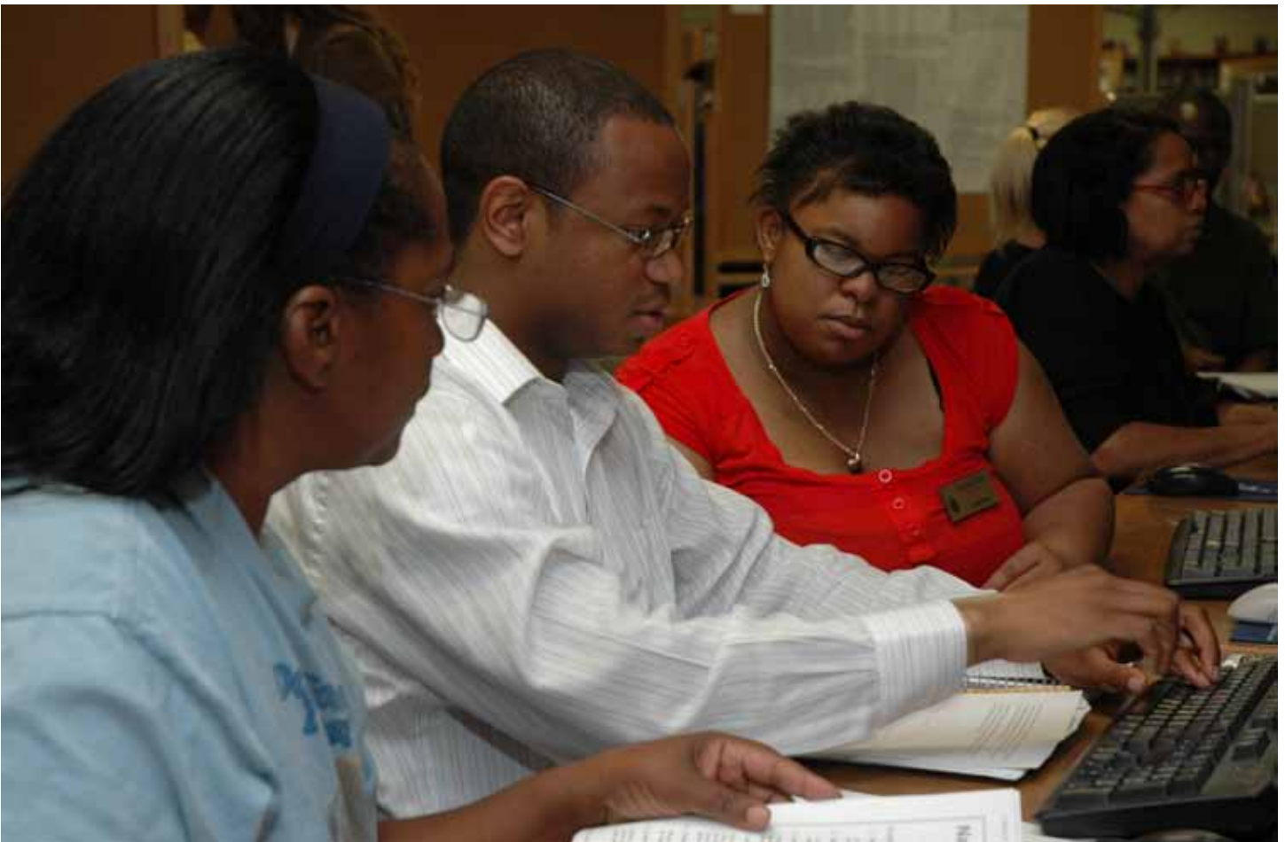
Students gather in a computer lab to work on a class project.