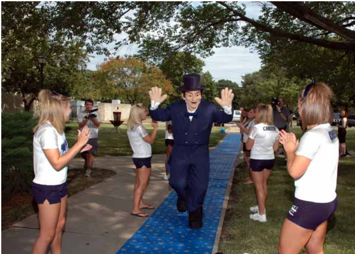
The Ichabod shows off the results of a makeover and updated wardrobe to admirers on campus.