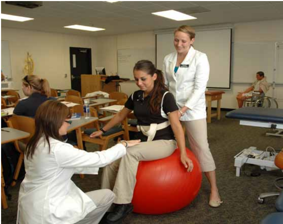
Physical therapy students learn various techniques during clinical assignments.

The Master of Social Work is administered by the Department of Social Work. For complete information about the MSW program, see Graduate Programs in the index.