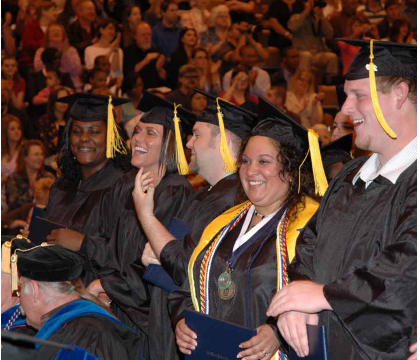
New graduates celebrate their accomplishments during commencement.