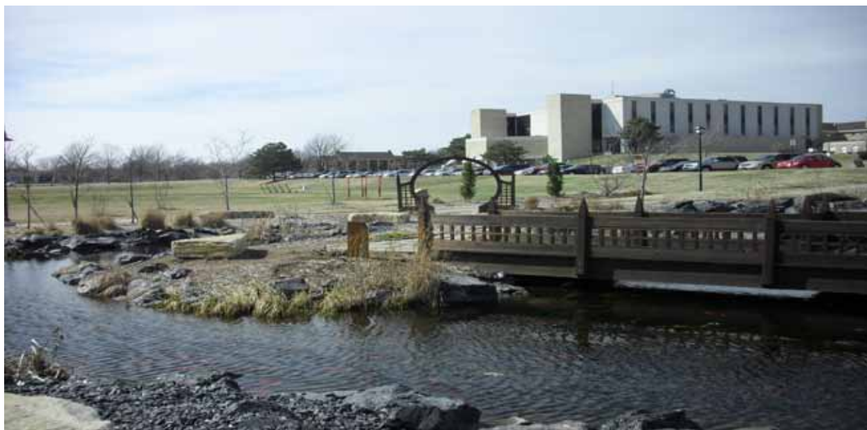
A view of the Washburn campus across the Harvey Garden.