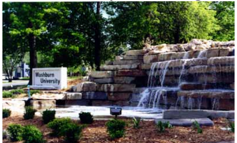
A water feature highlights campus at 17th and Washburn.