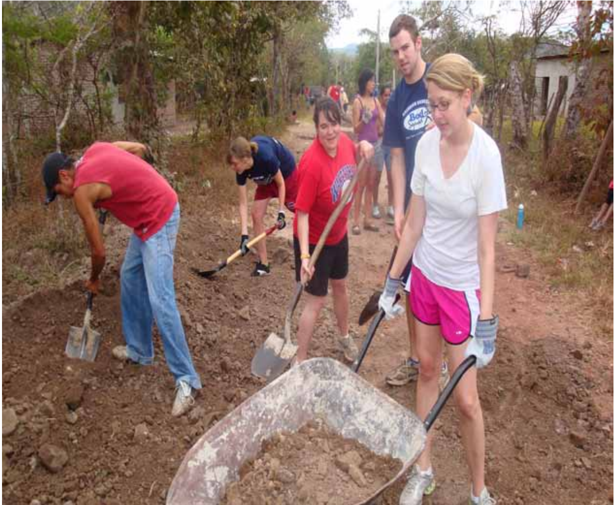
Road repair is an element of community service for Washburn students in a study abroad program in Nicaragua.