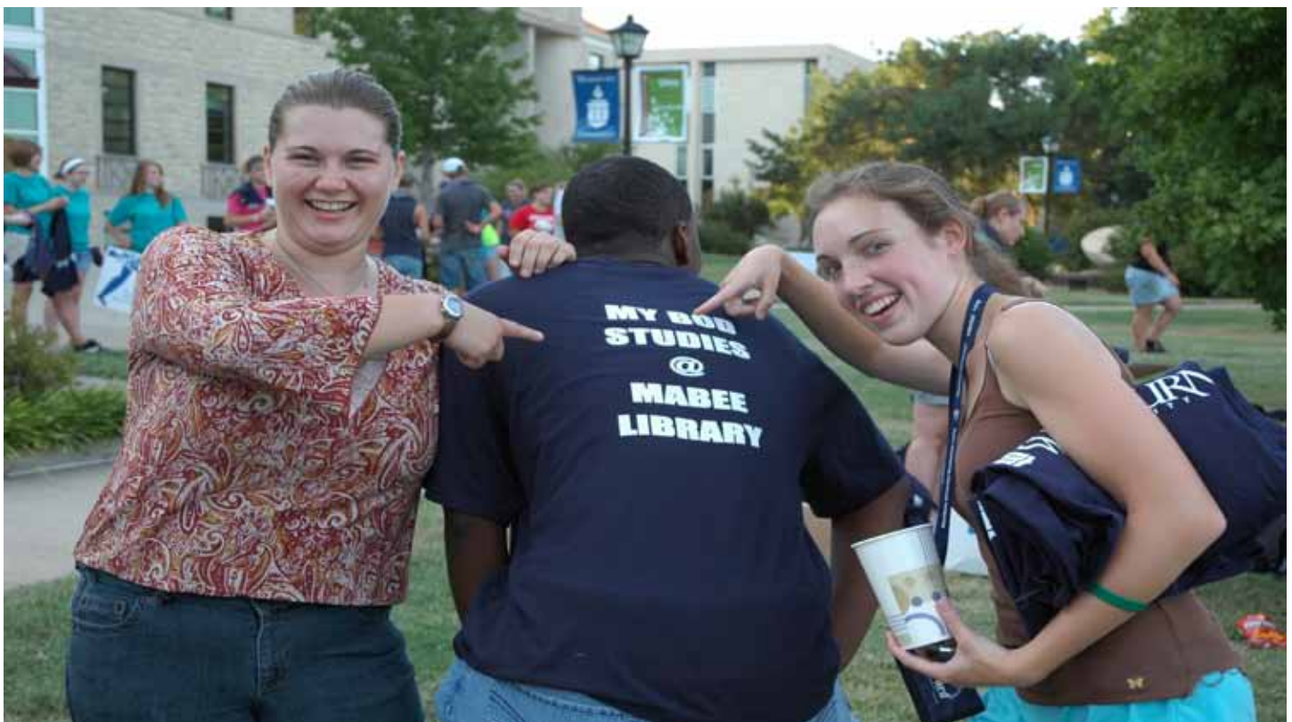
Students participate in a campaign to promote new features of the Mabee Library.

The diverse summer program is planned for students who wish to begin their college study, for those who wish to continue their regular academic programs, for high school youth who wish to pursue special interests, and for adults who wish to pursue studies on a professional level or for individual self-improvement.