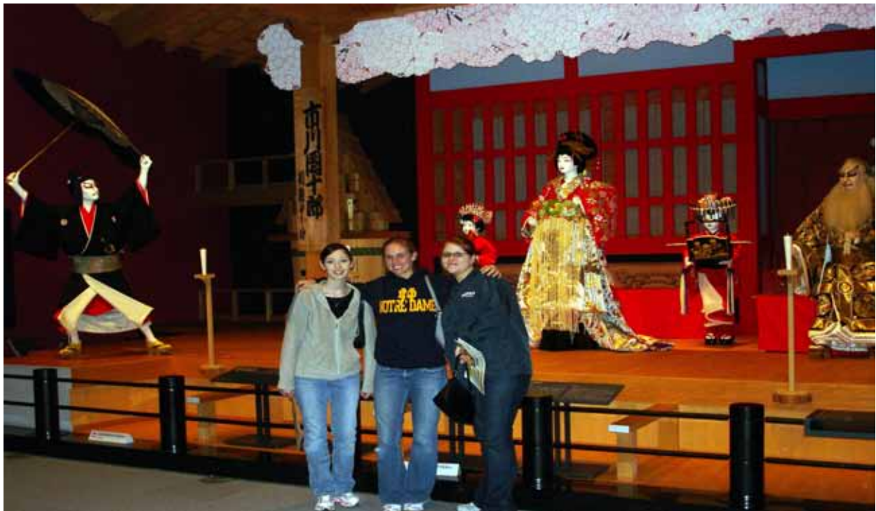
Students studying abroad become acquainted with artifacts of Japanese history at the Tokyo Museum.