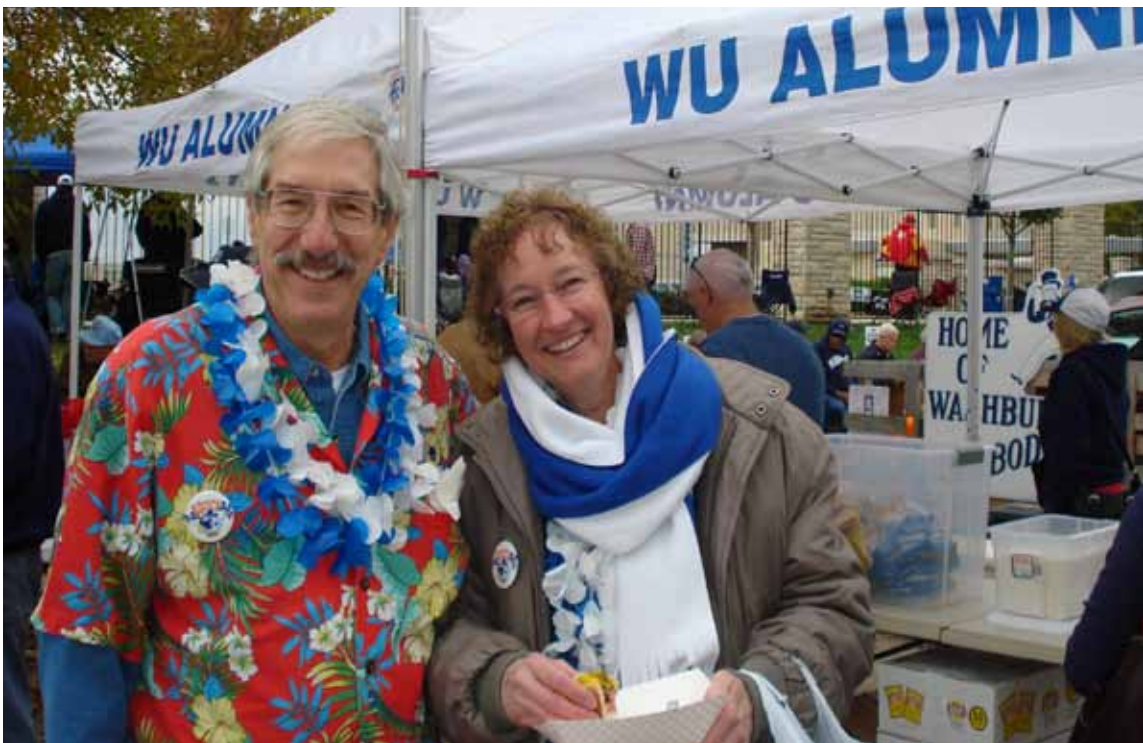
Faithful alums share their spirit at the Washburn University Alumni Tailgate Tent during Homecoming 2010.