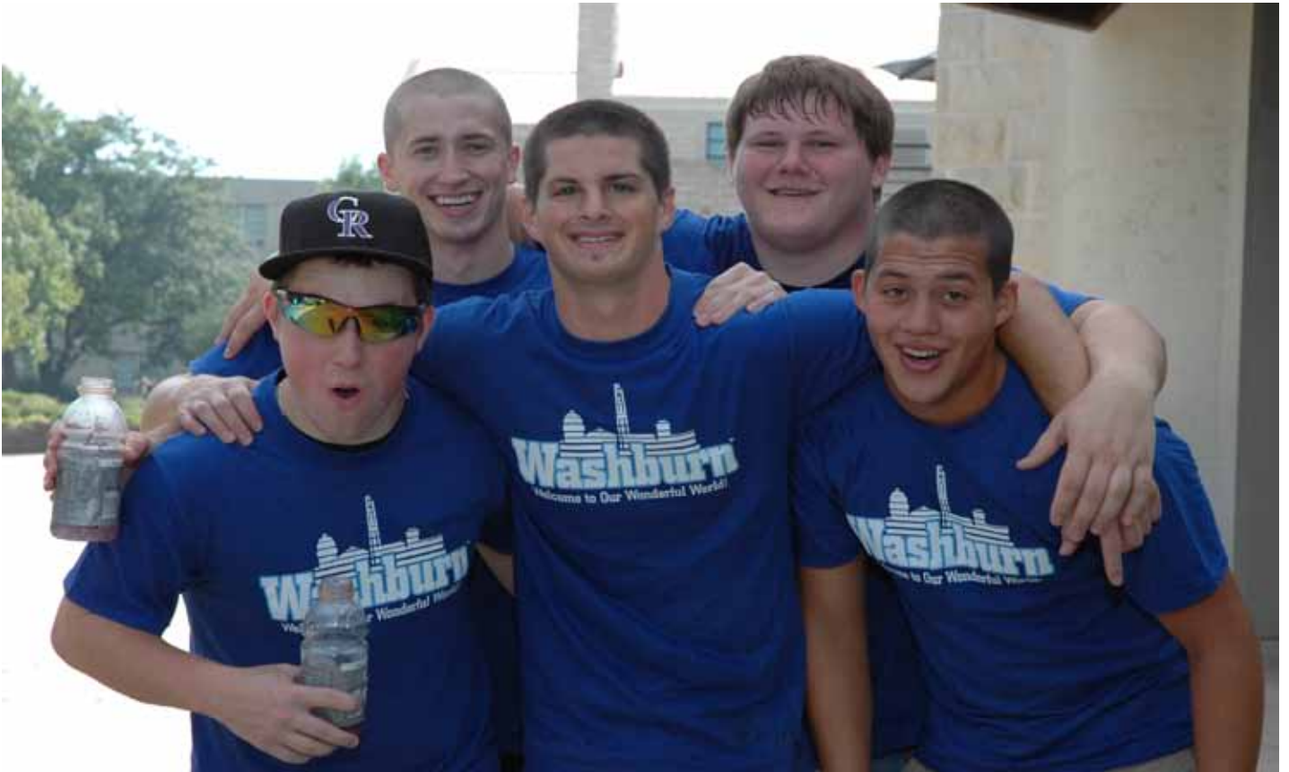
Student volunteers enjoy the camaraderie as they take a break from tasks on Move In Day.