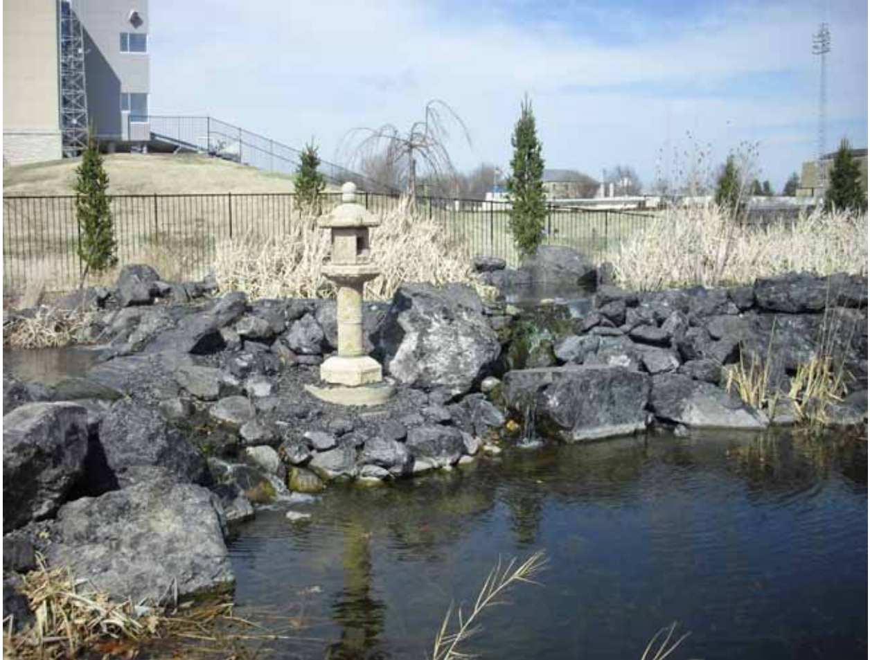
Harvey Garden, located south of Yager stadium, is often a place for quiet walks and meditation.