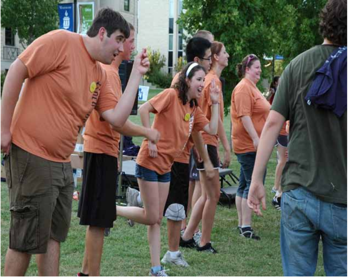
Admissions counselors energize new students during Welcome Week festivities.