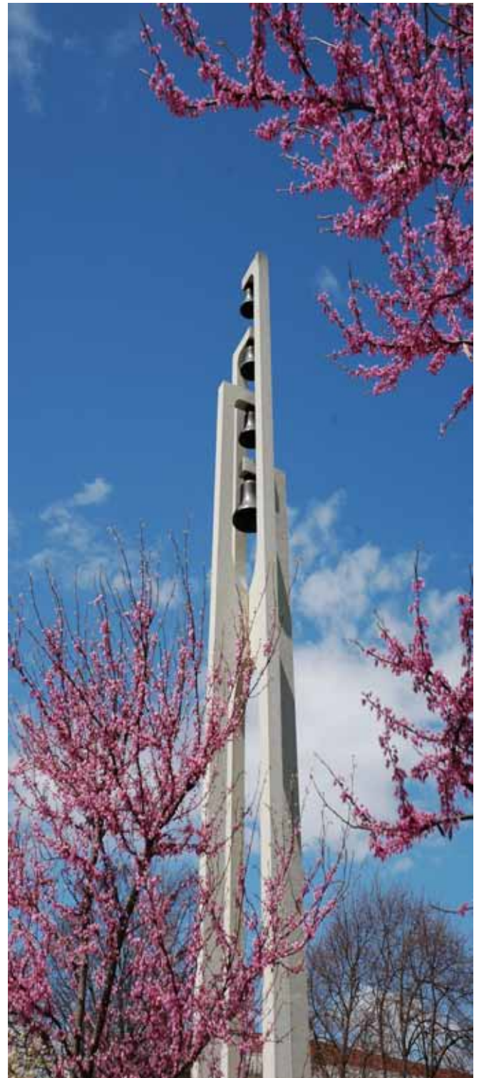
Kuehne Bell Tower serves as a landmark in the center of campus.