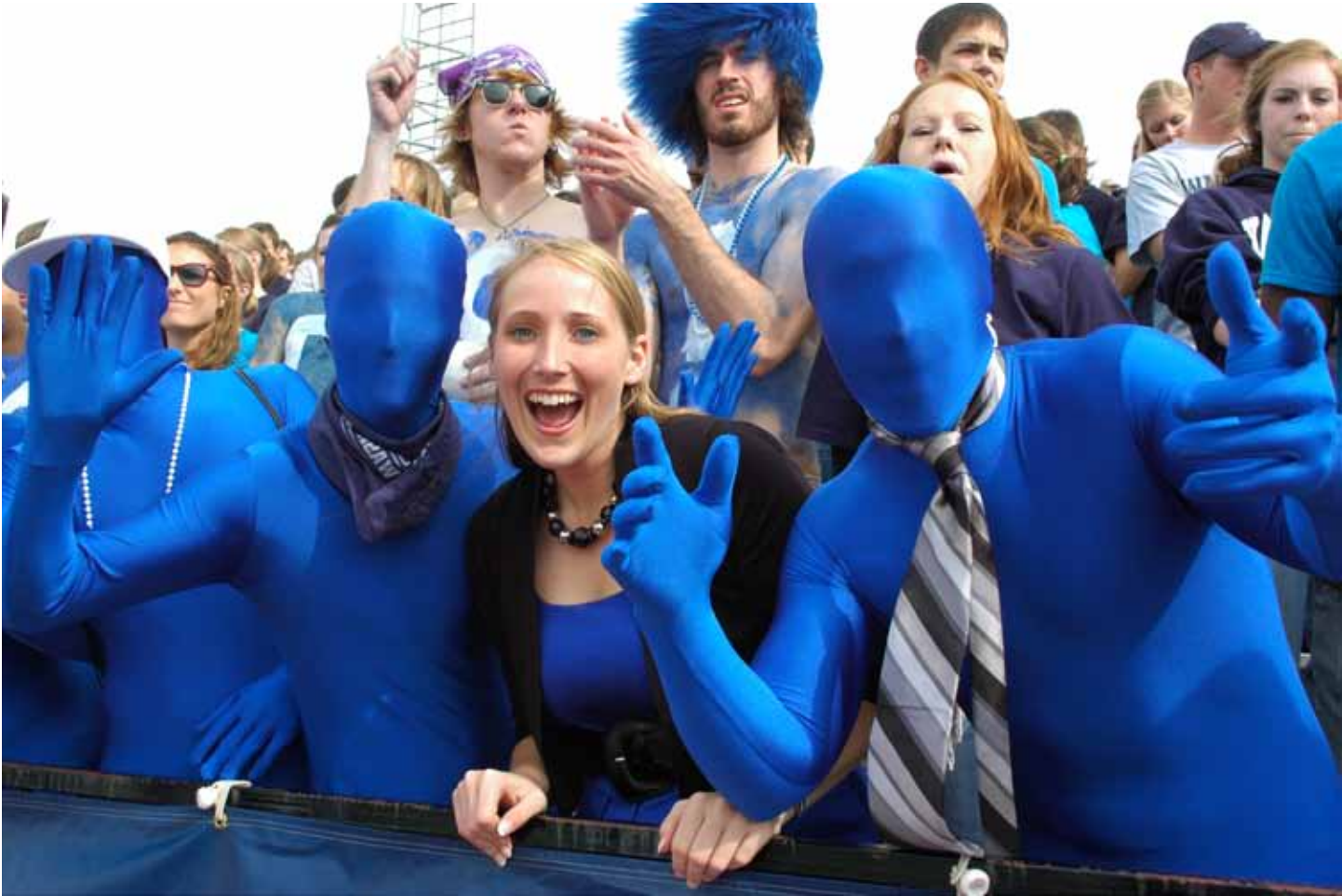
Blue is the outstanding fashion statement for football fans cheering on the Ichabods.