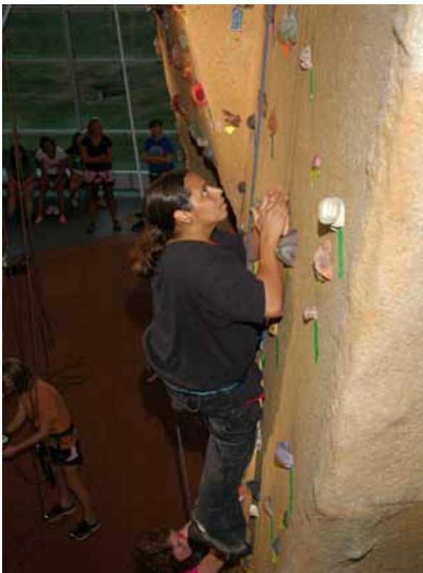
A student accepts the challenge of the climbing wall at the Student Recreation and Wellness Center.

Knowledge Based Information Systems (KBIS) combine operational data with analytical tools to present complex and competitive information to planners and decision-makers. The objective is to improve the timeliness and quality of inputs to the decision process. This topic will be discussed from the perspective of DSS (Decision Support Systems) and its associated technology. Emphasis will be placed on acquiring the skills necessary for the effective and strategic application of DSS and KBIS technology to assist in the decision making process. Prerequisites: 54 hours and consent of instructor.