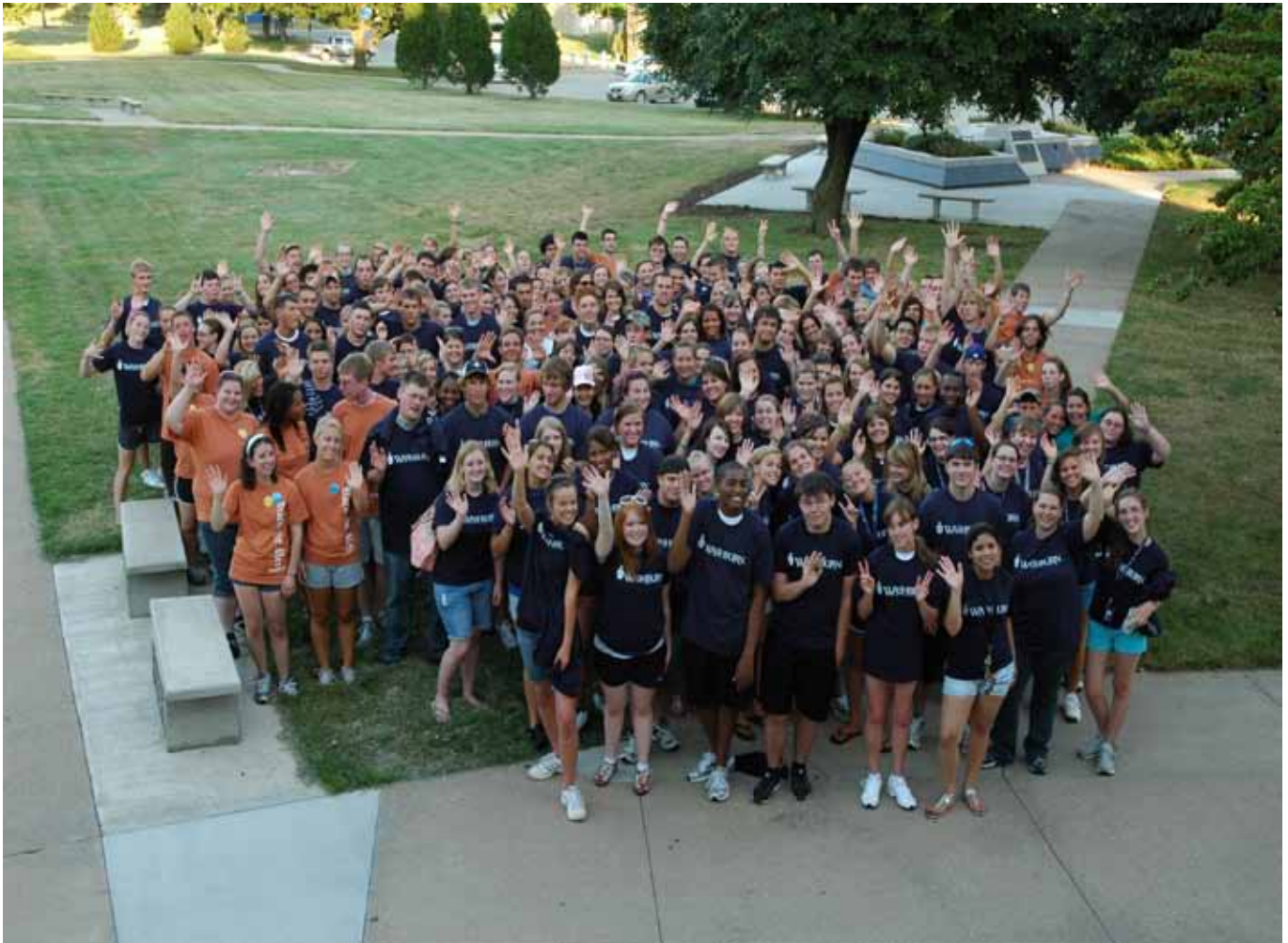
New students and orientation counselors gather for fun during Welcome Week on the Memorial Union lawn.