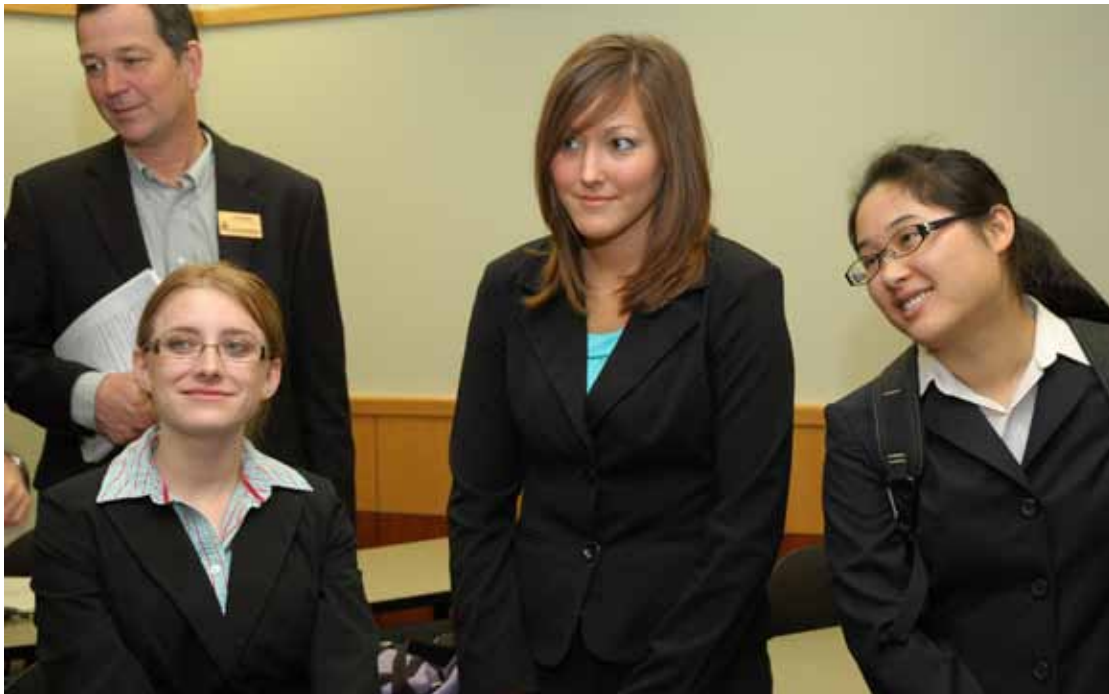
Business students listen to a class presentation.

toward the minimum 62 hours in the School of Business required for the BBA. The student's grade will be awarded on a pass/fail basis, as determined by the supervising faculty member. Prerequisites: Consent of major area faculty, appropriate background, at least seventy-five (75) semester credit hours, at least a 2.5 overall GPA and meet the general qualifications specified by the sponsoring business firm or governmental agency.