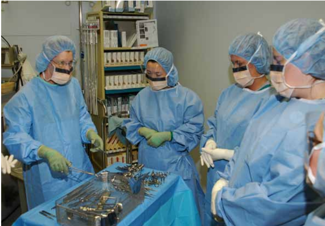
Nursing students learn various operating room techniques.