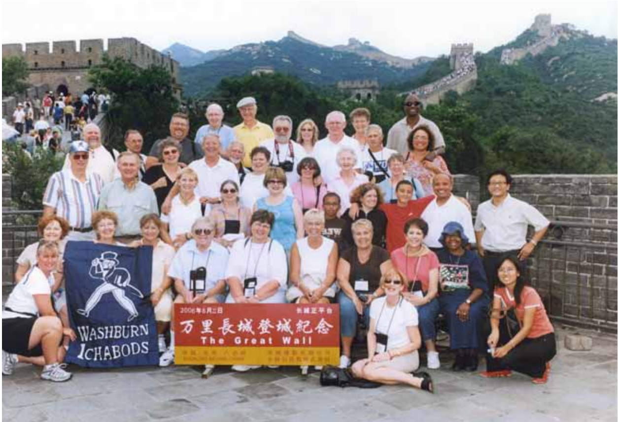
Alums visit the Great Wall in their travels through China.