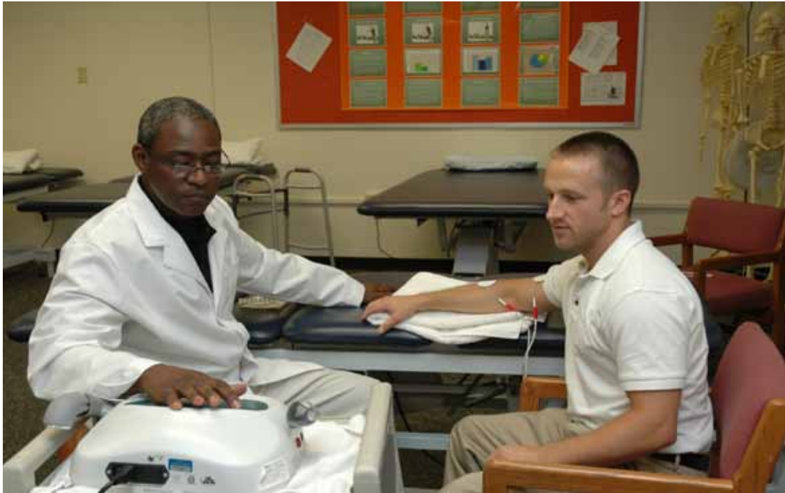
Physical Therapy students learn various techniques during assignments.