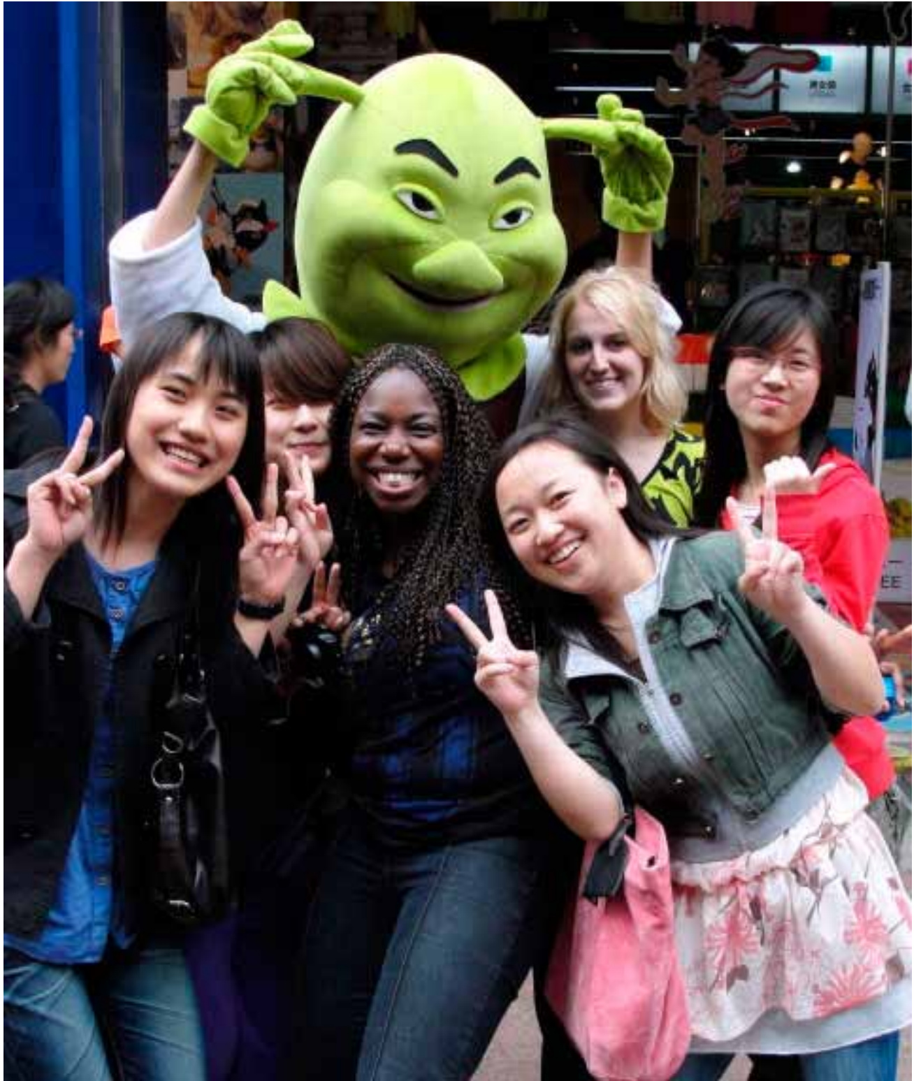
Students visiting China as participants in Washburn's International Business Entrepreneur have a playful moment.