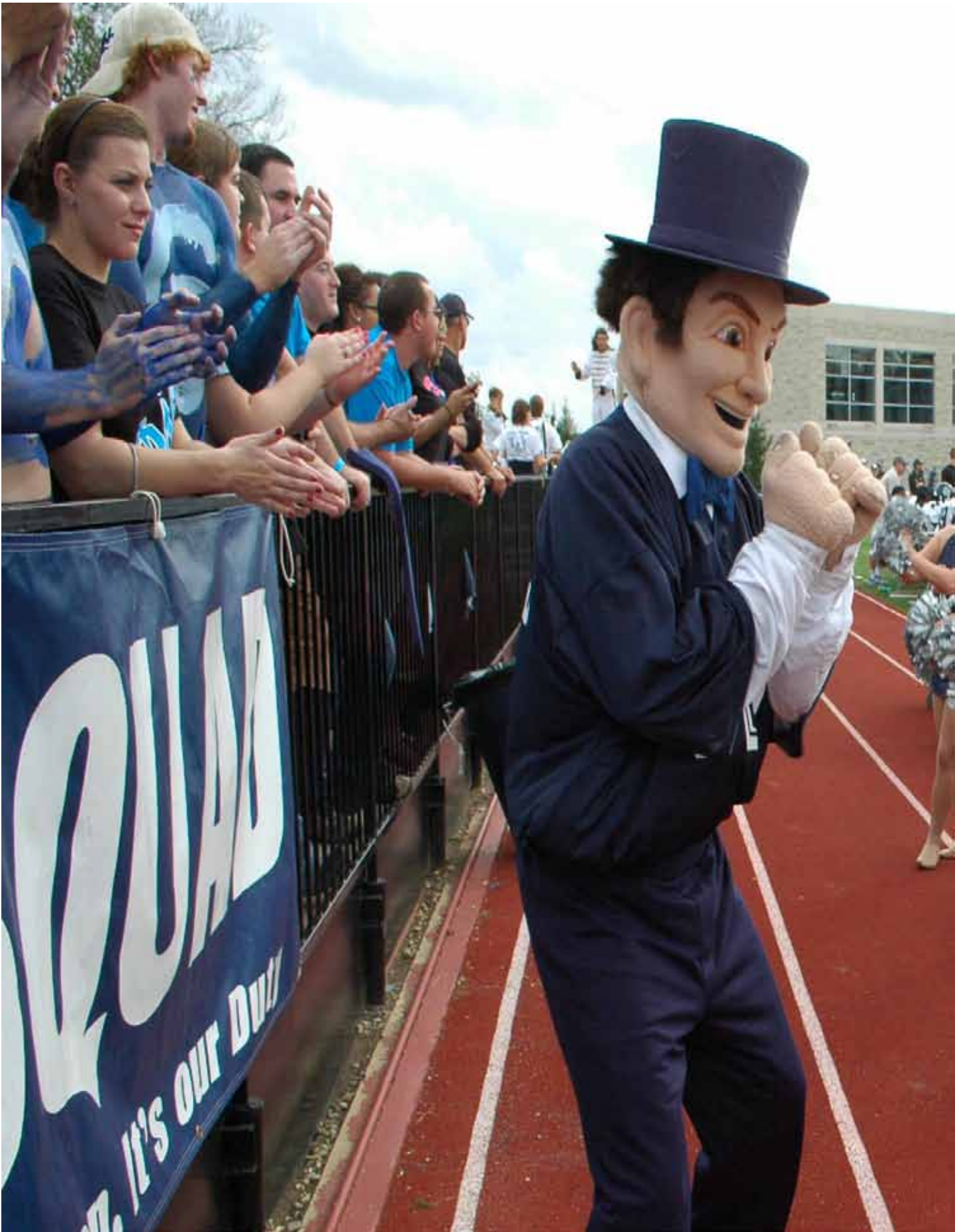
The Ichabod instigates a rousing show of team pride at a football game at Yager Stadium.