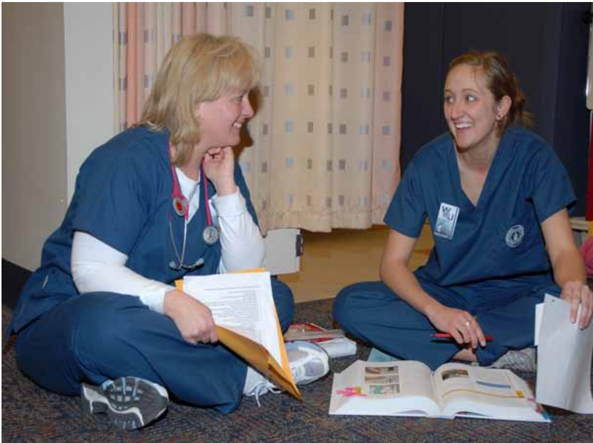
Nursing Students compare notes before class.

Focuses on health care needs of clients and families with complex alterations in health patterning. Emphasis will be placed on the professional nursing role in planning care with clients and families with complex needs. Ethical, legal, economic, health policy and spiritual considerations related to complex client needs are addressed. Prerequisite: Registered Nurse student or consent.