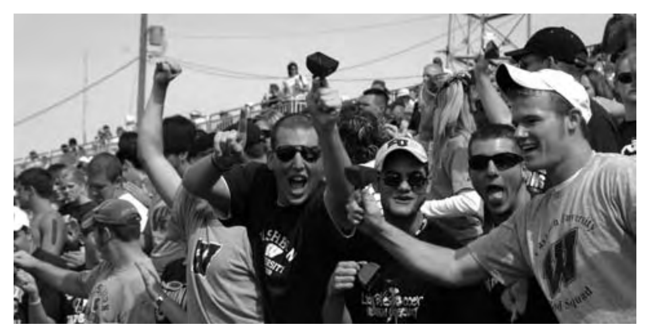
The student section is alive with Ichabod pride at football games.

This an elective course which consists of an integrated program of printed and audio instructional materials focused on learning generic Spanish designed for the workplace [i.e. requesting personal information of a limited nature] and content introducing students to the history and experiences of Latino and Hispanic populations throughout the U.S. Students will be exposed to the rich diversity, strengths as well as challenges, of immigrating populations. Issues of social injustice and oppression are explored including immigration and social welfare policies. Through case examples and assignments, students will have an opportunity to critically think about application of course context to social work practice. Active participation of students is required. Graduates taking this course will have different assignments and additional learning objectives than undergraduates. Both groups of students will learn the same generic Spanish material. Learning is facilitated through the use of some on-line discussion and instruction. Prerequisites: Admitted MSW students only and completion of a minimum of 15 credit hours of MSW foundation coursework or consent.