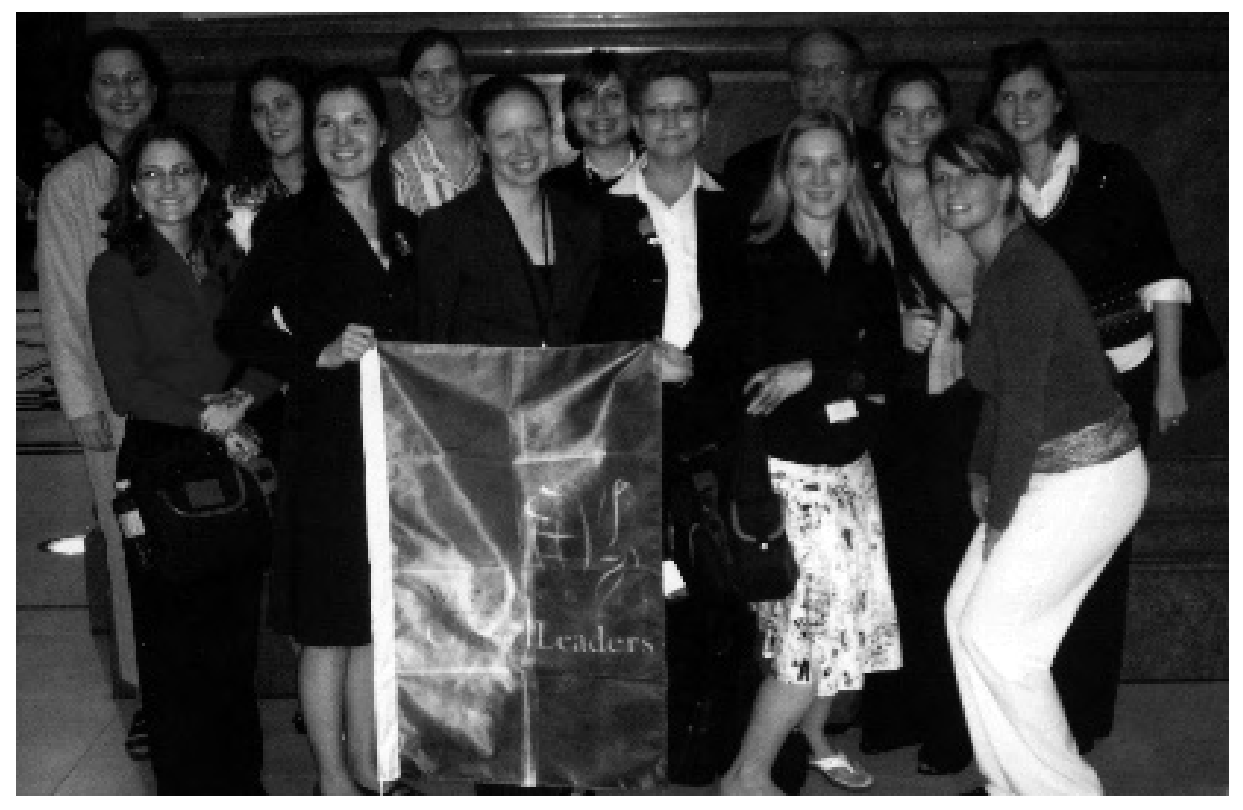
Students and faculty begin a journey to Abu Dhabi, United Arab Emirates, to attend the 2006 Women as Global Leaders Conference. Also participating in the event were more than 1,000 undergraduate women from 75 countries.