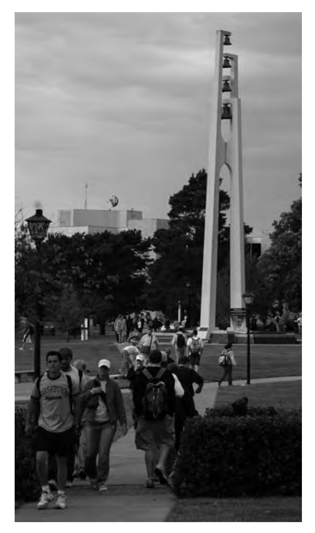
The Kuehne Bell Tower, a centerpiece of campus, features a quartet of bells once housed in the clock tower of Thomas Gymnasium, which was destroyed during a tornado in 1966.