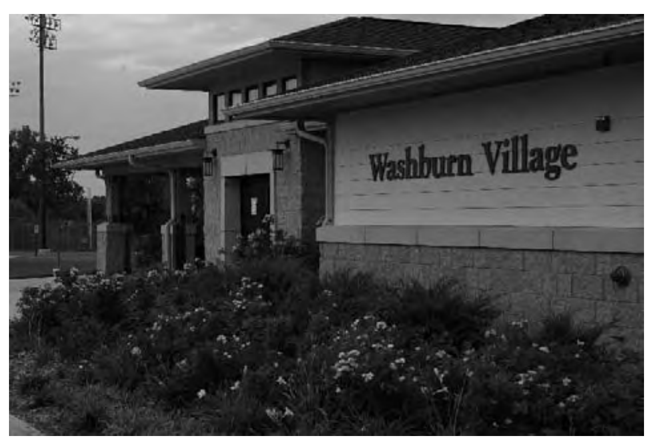
The newest residential facility on campus is Washburn Village, a 192-bed apartment-style housing complex for students.

Eligible recipients of educational assistance must certify their enrollment each semester through the Student Services Office to assure continuous benefits. When changes in enrollment occur, such as dropping courses, not attending class, or not formally withdrawing from the University, the student must submit a report of mitigating circumstances. The VA expects the veterans to pursue an educational objective, regularly attend classes, and make satisfactory progress.