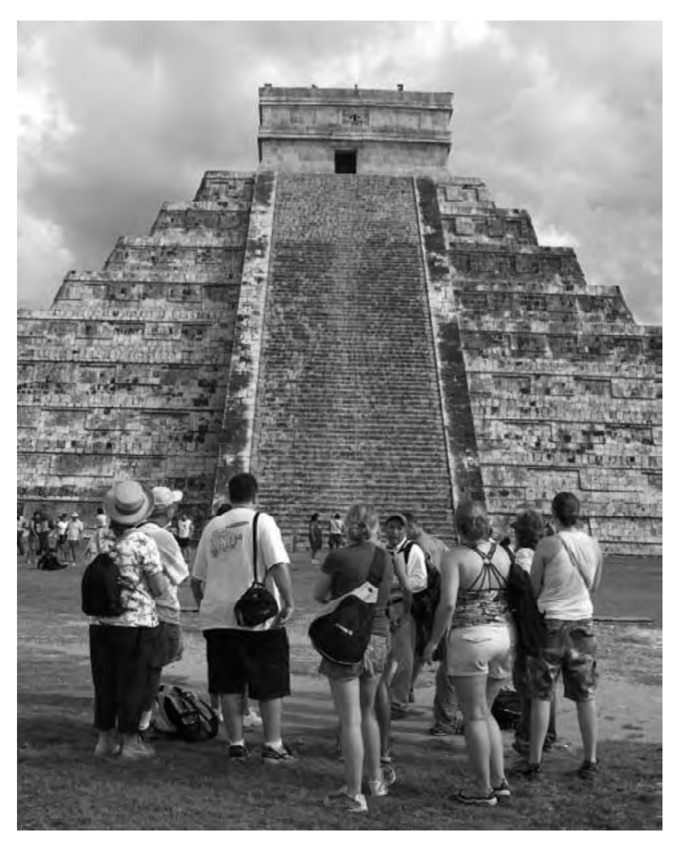
Marvels of ancient civilizations are viewed by students participating in a study abroad program in Yucatan during winter break.