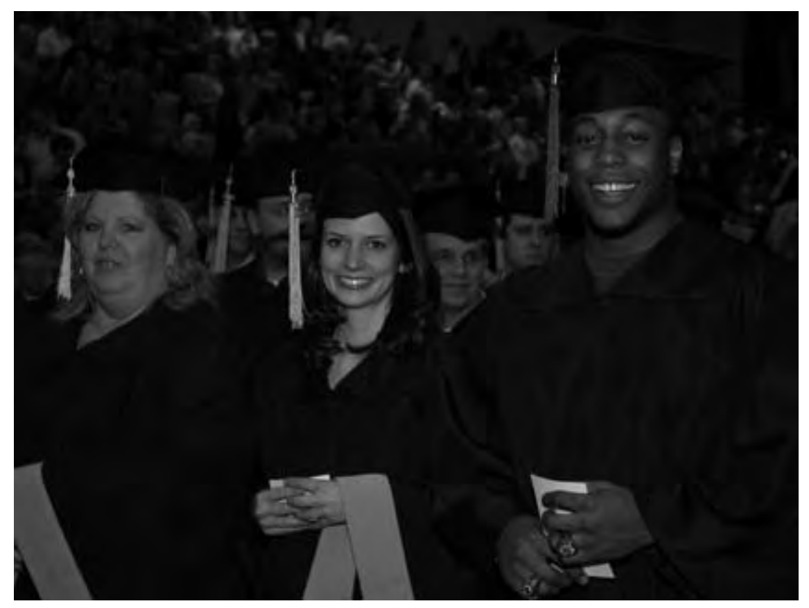
Three candidates for graduation wait their turns to cross the stage at commencement.