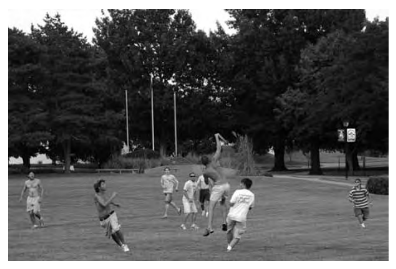
A friendly game of Frisbee is enjoyed on the campus lawn. Games of Ultimate Frisbee are the focus of the student organization, Washburn Ultimate Players Association.