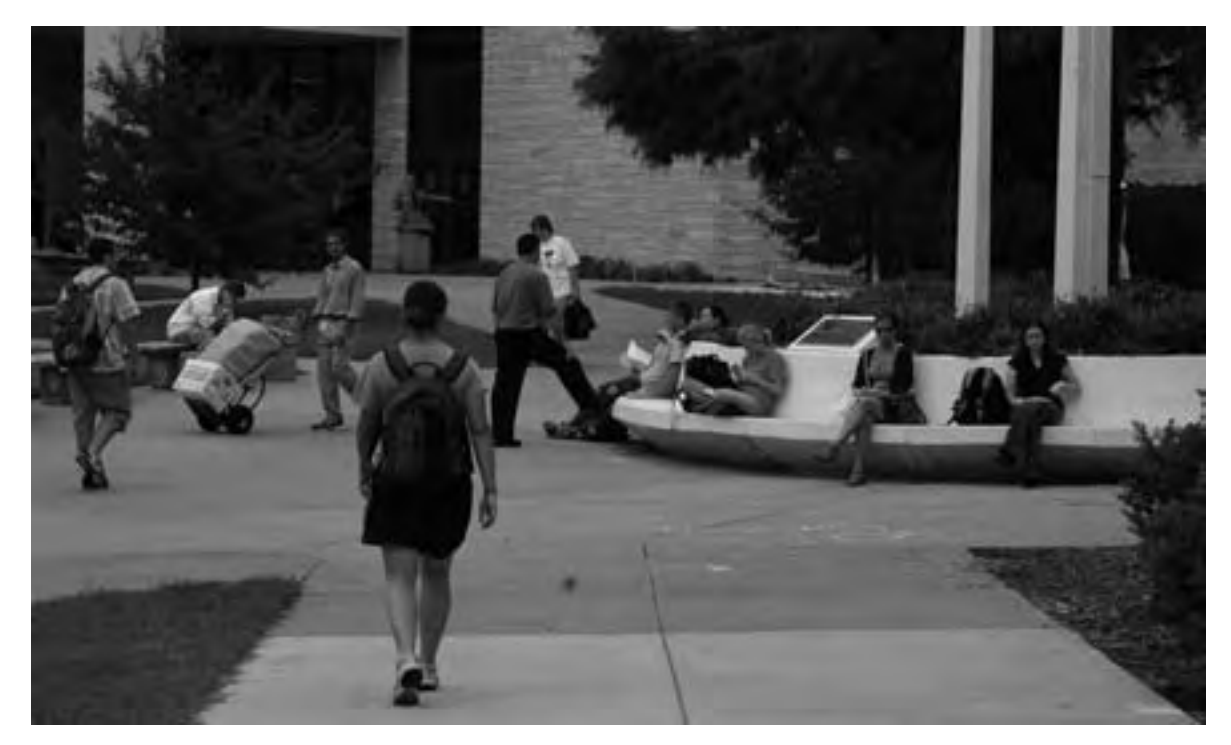
Pleasant weather encourages students to take a break at the Bubb Light Circle near Henderson Learning Resources Center.