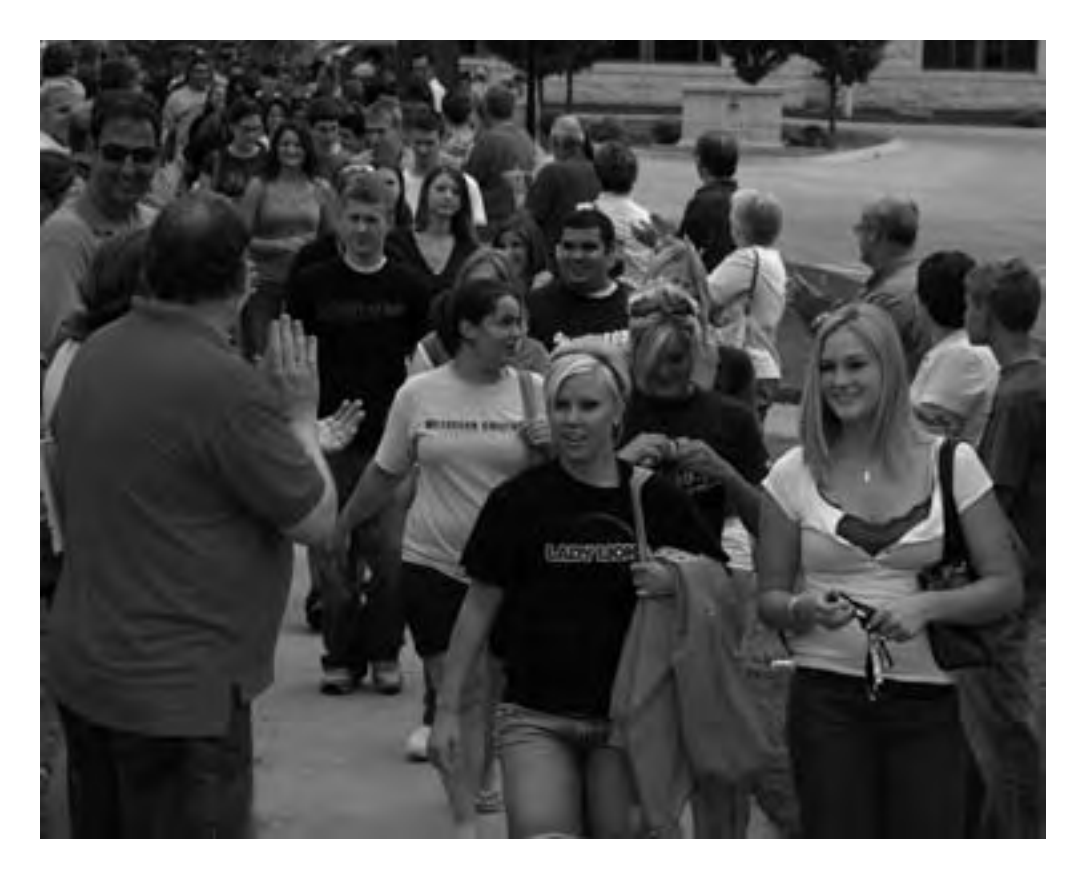
Family members, faculty and staff form a colonnade to cheer on new students participating in Bod Blast events at the beginning of the fall semester.