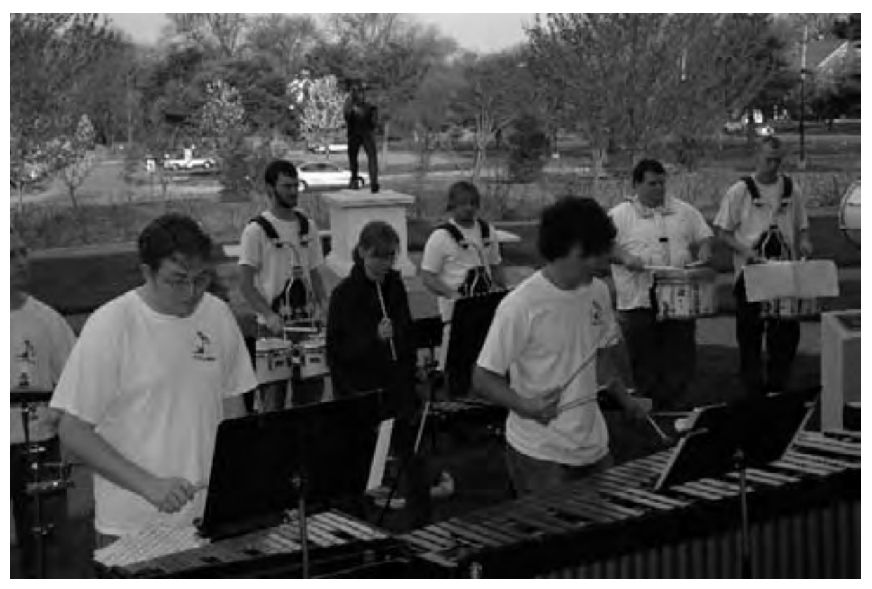
Percussion students serenade a gathering in the Joss Garden at the Bradbury Thompson Alumni Center.