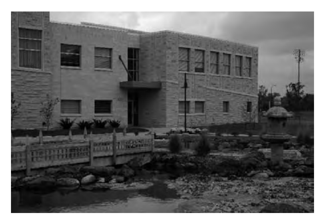
Harvey Garden, north of the art building, features a Japanese theme, with a quiet water pool and arched bridge. The garden honors the late Leland Harvey, bba 63.